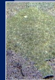
Black sea turbot fisheries and picked dogfish