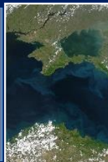
High-level conference on the Black Sea (Romania, 2016)