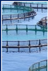
Regional Conference Aquaculture (Italy, 2014)